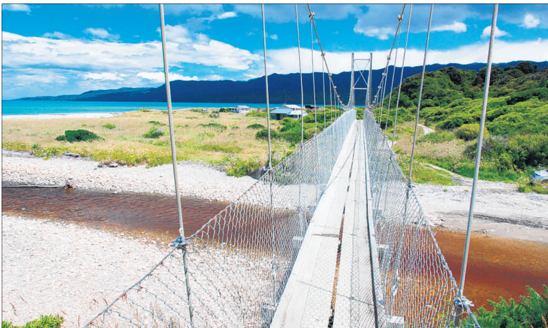
Swing bridges are negotiated in darkness during Stump the Hump, but can be appreciated in daylight during other hikes.

steepest stretch, and after a bit of a grunt we're on top of the ridge. A faint glow of lights at Okaka Lodge is now visible, and soon I'm resting in front of a fire savouring every spoonful of hot porridge.